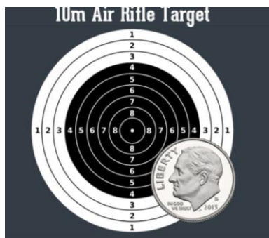
Small; isn't it?

Targets have a total diameter of just 45.5mm or 1.79 inches. The inner ring is a mere .5mm in diameter.