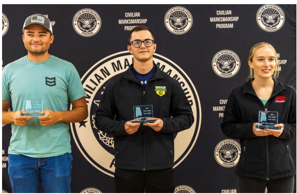
These are the Junior Sprint winners.