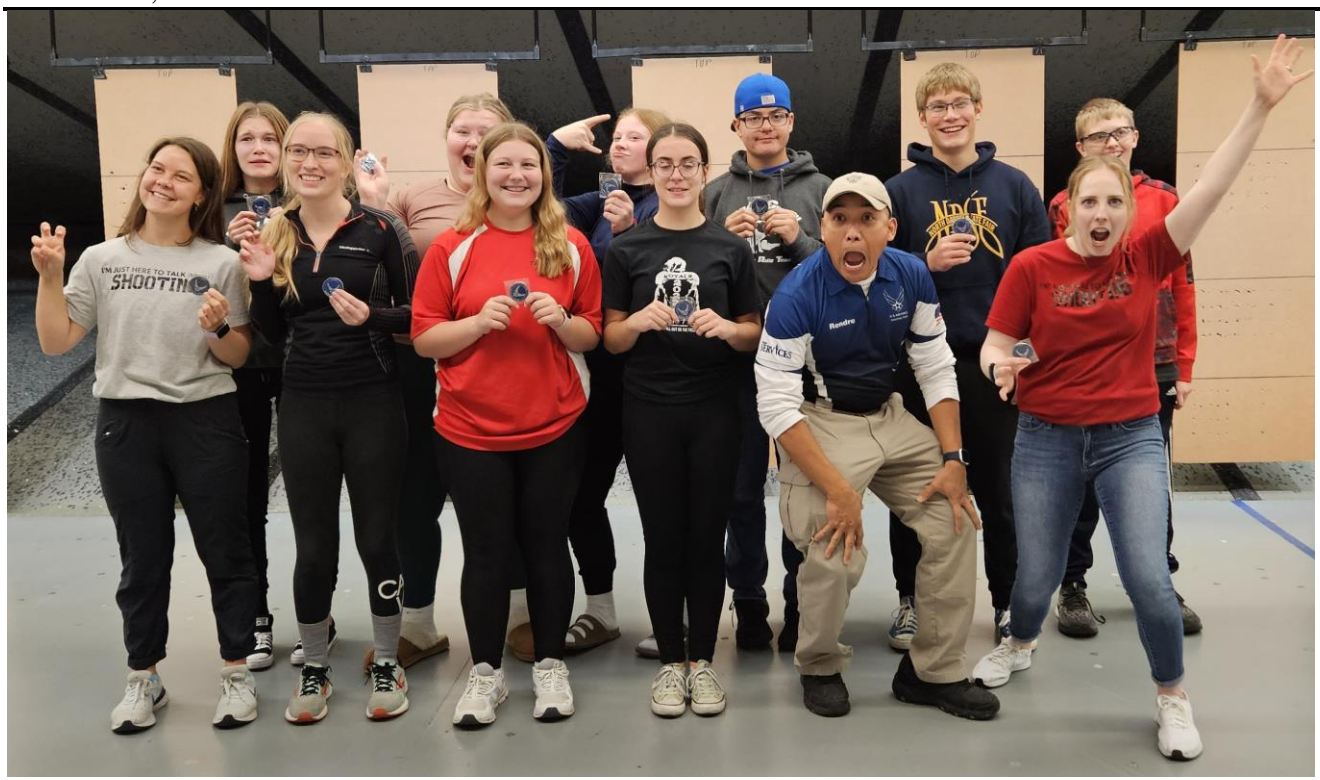
Some Photos from the Dixie Double

Volume 30, Number 2 ISSN: 1086-4172 December 2023