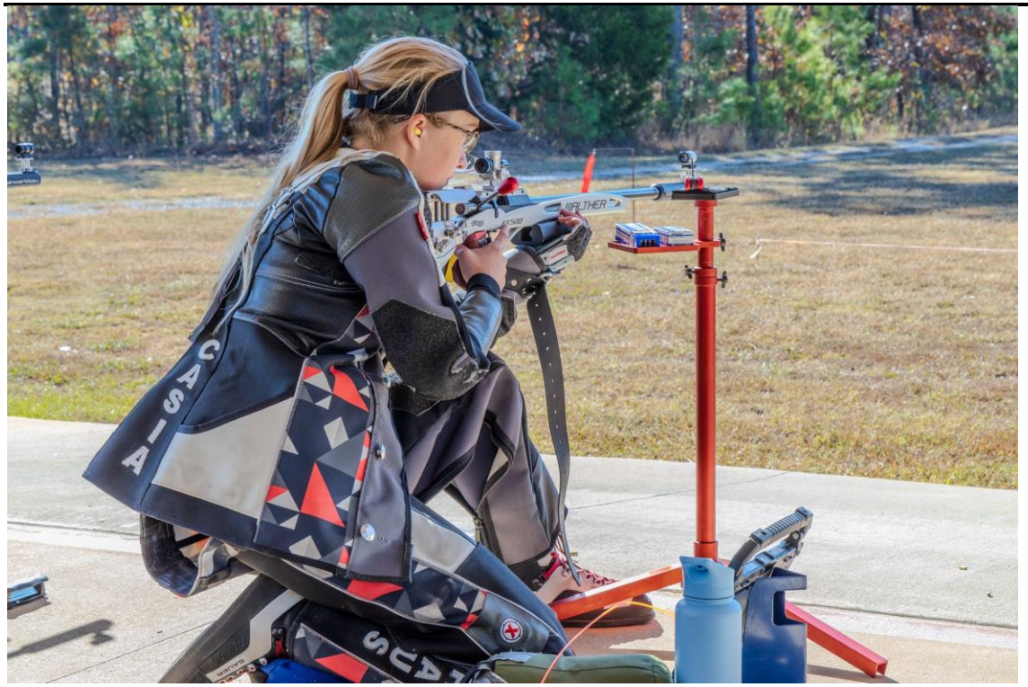
Smallbore at the Dixie Double

Volume 30, Number 2 ISSN: 1086-4172 December 2023